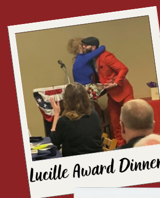
Lucille Award Dinner